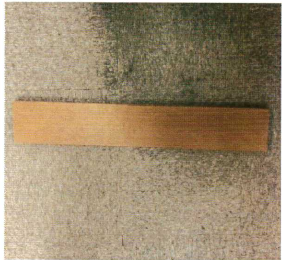
Fig.2 Back View