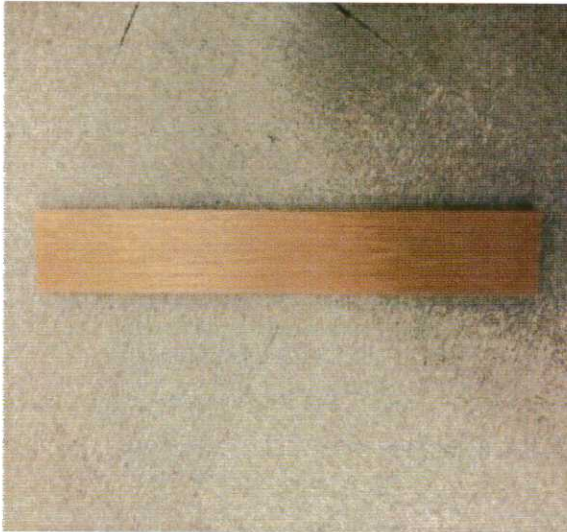
Fig.1 Front View (Test Face)